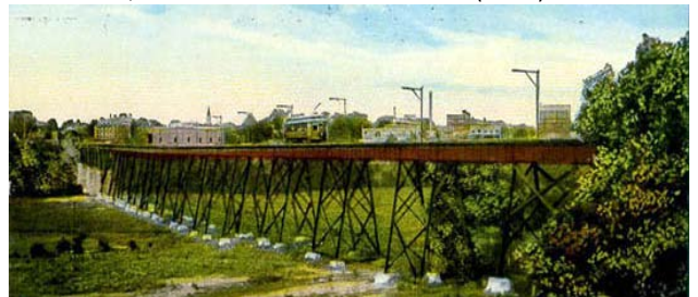
Interurban Bridge and Danville, 1915