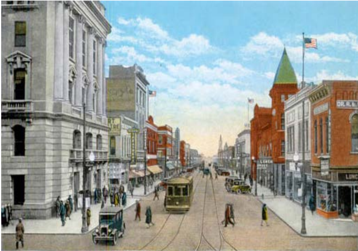
Main Street in Danville, looking east from public square, 1925