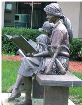
Danville Public Library

233 S. State Street, Westville 61883 ..... Bus: (217) 267-3170