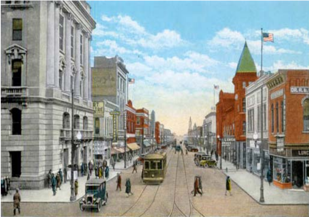
Main Street in Danville, looking east from public square, 1925