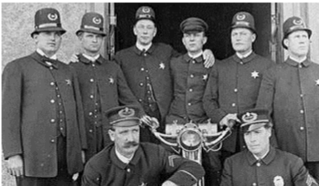
The Danville Police Department, 1916