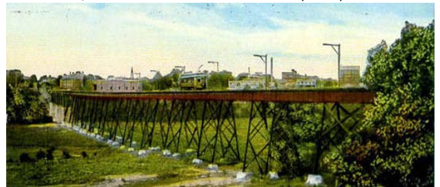
Interurban Bridge and Danville, 1915