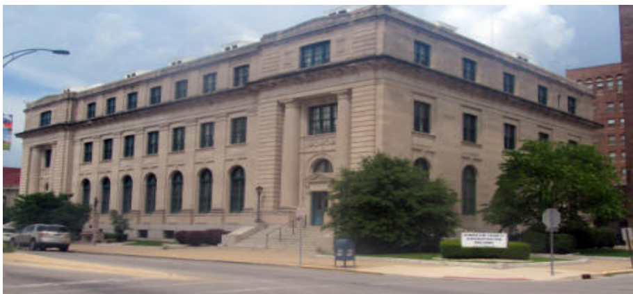
Vermilion County Administration Building - 2018 201 N. Vermilion St. Danville